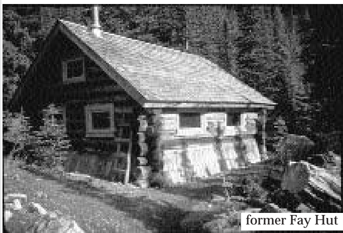
former Fay Hut

Y es, folks, it's that time of year again--no, I don't mean winter (although it is that, too); I mean time for another one of my wildly popular and much-anticipated National Board reports. Now, hang on a second--I see you reaching to turn the page, but I would highly recommend that you at least skim over this article, if not (preferably) read it in detail. Some fairly important matters were discussed at the last National Board meeting, and while it may not be as exciting as reading about that powder ski trip or the beta on that ice climb you've been wanting to do, I believe you owe it to yourselves as ACC members to keep abreast of and informed about what's happening in your National Club these days.